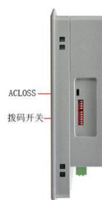
侧面 I/O 视图