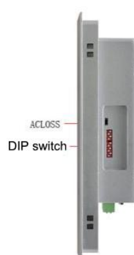
Lateral I/O View