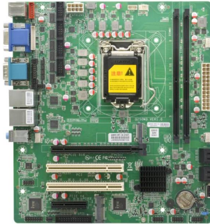
Q250M3 VER:1.0A 正面图