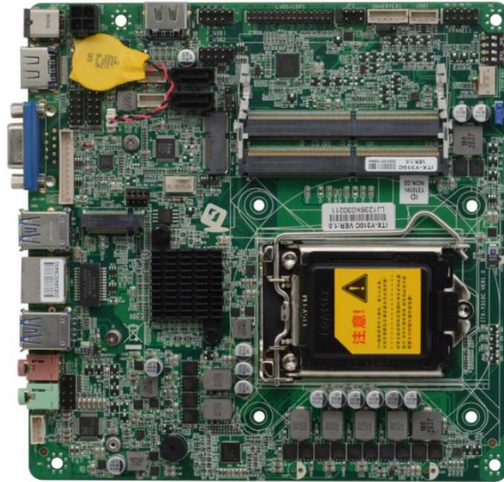
ITX-Y310C VER:1.0 front view