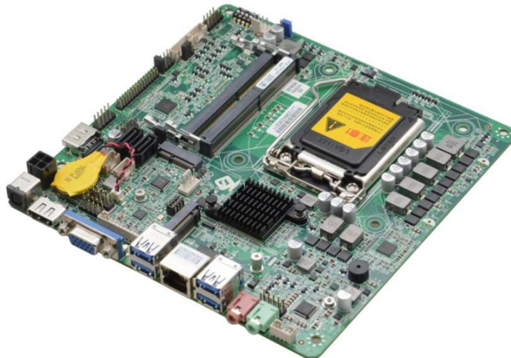
ITX-Y310C VER:1.0 side view