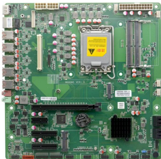
W680MS VER:1.0 主板正面图