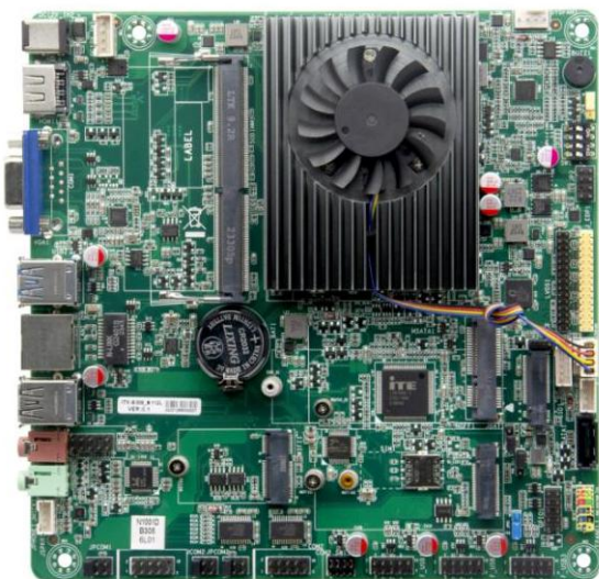
ITX-B306_N112L VER:0.1 主板正面图