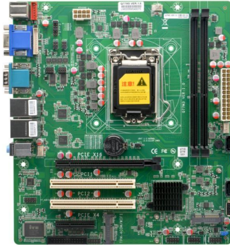
B76M3 VER:1.0 正面图