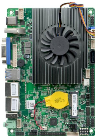
EPIC-E73_I526L VER1.1 主板正面图