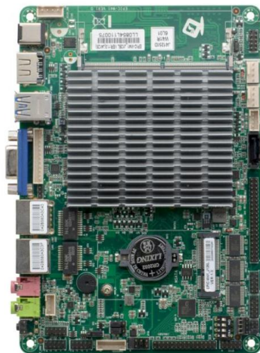
EPIC-W41_J126L VER:1.0 主板正面图