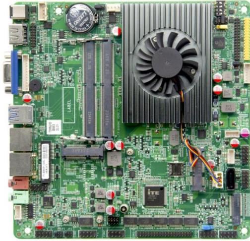
ITX-B680M1_I526L VER:0.1 正面图